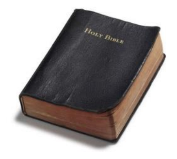
The Bible is the Word of God